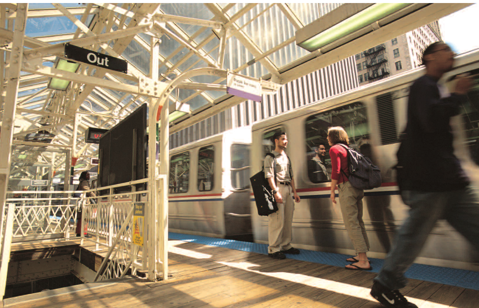
The Adams Street L stop, two blocks from the building. Students receive a UPASS which provides 24/7 access to the bus and train system throughout the city.

After taking conservatory classes and Chicago's cultural experience, students come home to the University Center of Chicago (UCC), CCPA's dormitory in the heart of the loop. University Center of Chicago, our state-of-the-art residence hall is just one block away at the corner of State Street and Congress Parkway. This facility features a mixture of studios, suites, and apartments with ample spaces for studying and socializing, including a beautiful rooftop garden terrace. Upperclassmen and graduate students may also live off campus in Chicago's beautifully diverse neighborhoods, easily accessible by mass transit.