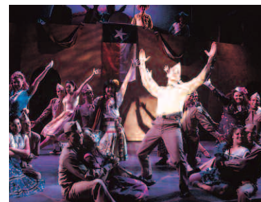
Something for the Boys