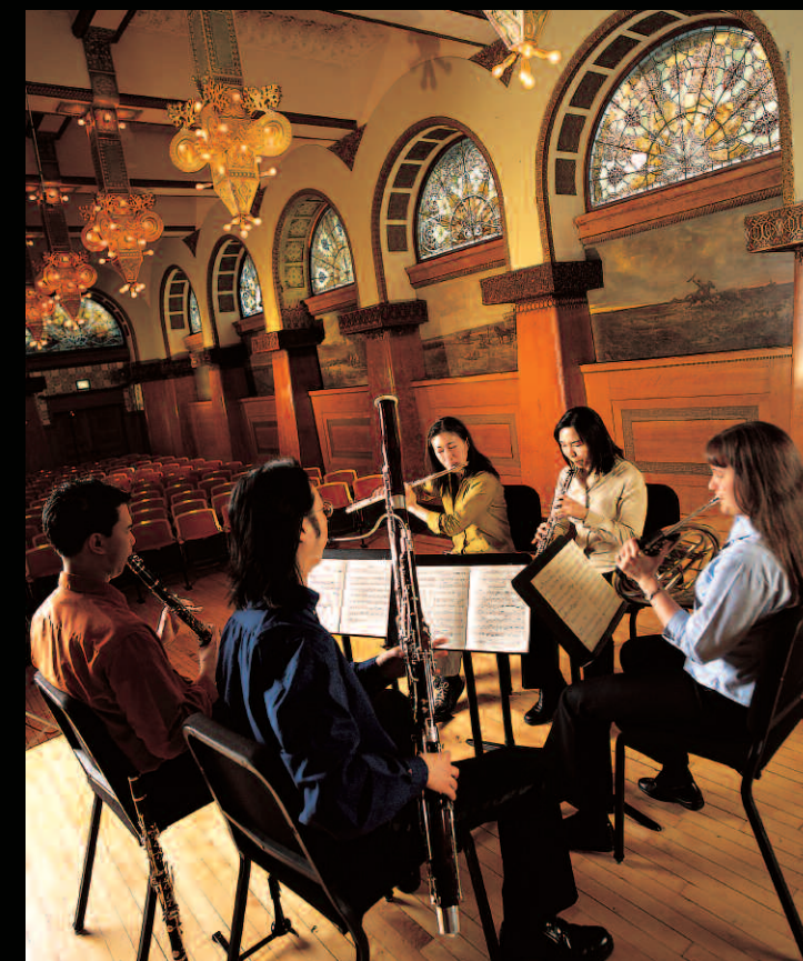
Student Chamber Ensemble

Students have a range of options, both within the school and in the larger musical community of Chicago. They perform individually or as members of ensembles in more than 250 concerts, operas, and recitals every year. They also participate in internships and performing opportunities with groups such as the Civic Orchestra of Chicago and the Grant Park Apprentice Choir. Recent students have interned and performed with the Philadelphia Pops, Chicago Opera Theater, Chicago Symphony and the Newberry Library Foundation. In addition, our location provides access to recording sessions and other commercial music opportunities.