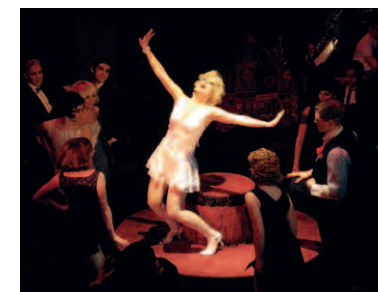
The Wild Party