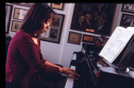
Piano student practicing in the Ganz Studio