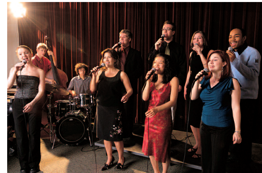
Vocal Jazz Ensemble