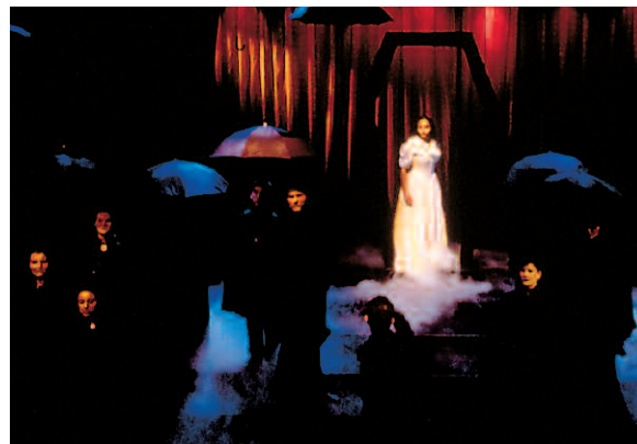
The Unkindness of Ravens